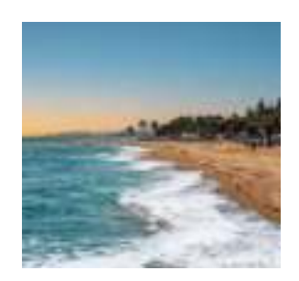
BEACHES - 10 MIN -