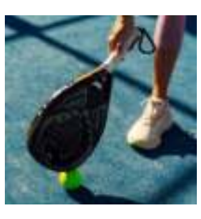
TENNIS CLUBS - 9 MIN -