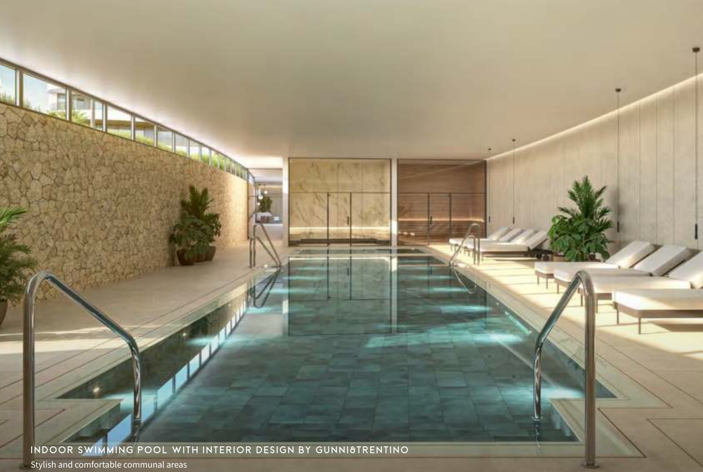
INDOOR SWIMMING POOL WITH INTERIOR DESIGN BY GUNNI&TRENTINO