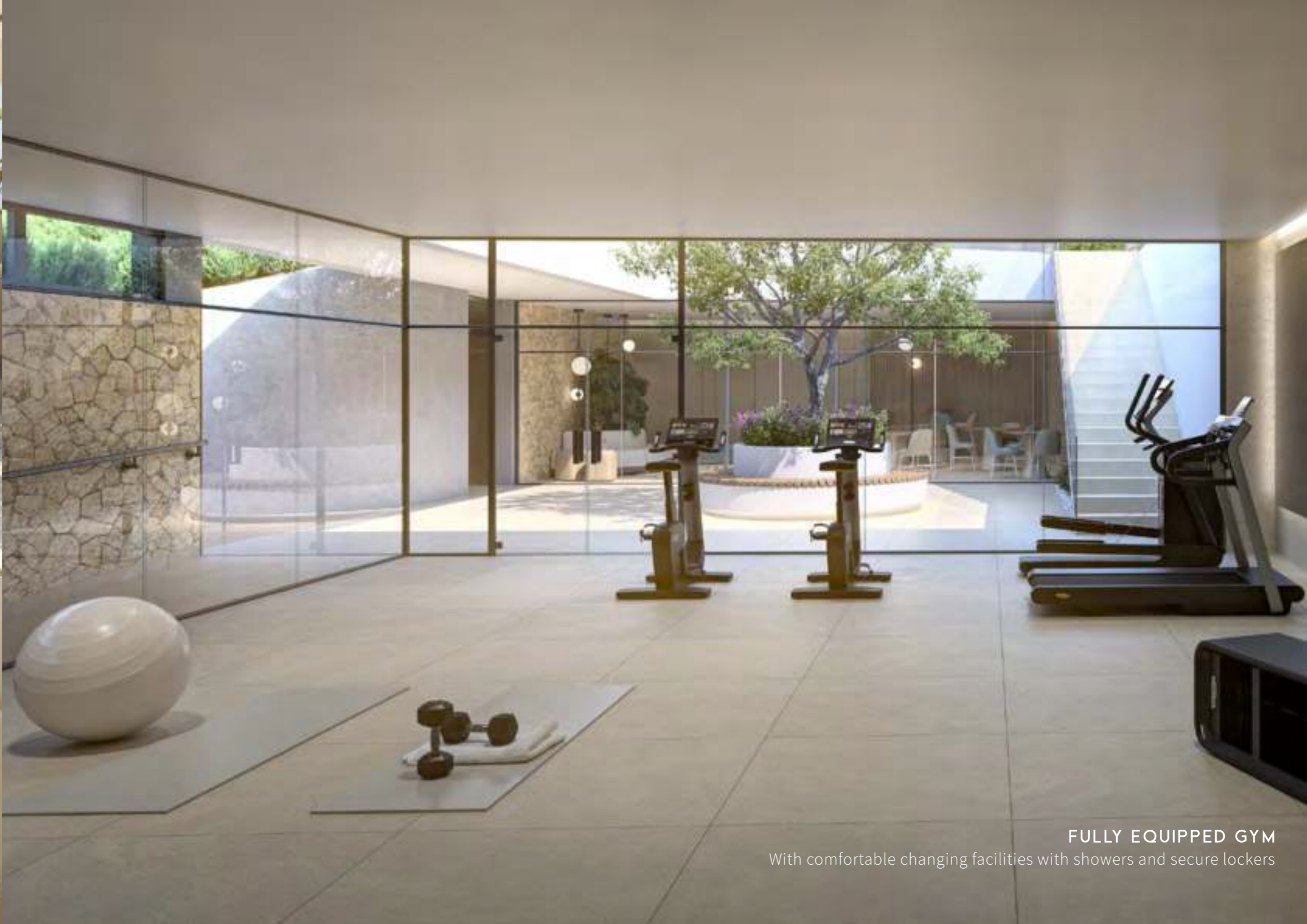
FULLY EQUIPPED GYM With comfortable changing facilities with showers and secure lockers